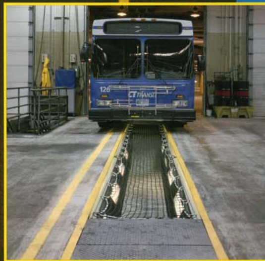
BayNets™ Mass Transit