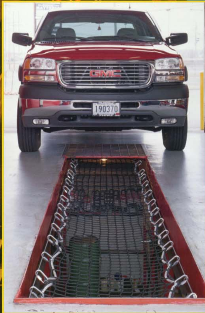
BayNets™ Automotive Quick Lube Facilities

BayNets™ products are easily adaptable to rail, bus and virtually all other commercial fleet maintenance facilities