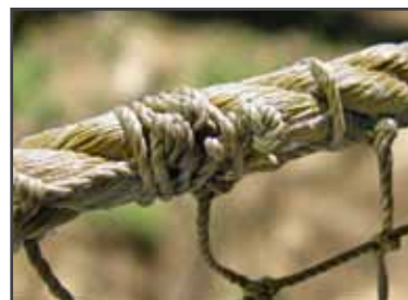
1.25" ProManila lashed to P820K with #36 Polyester twine