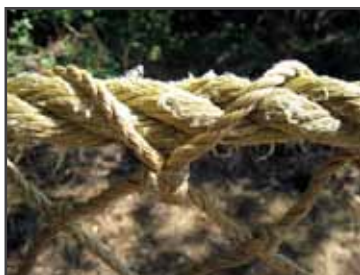
1.25" ProManila woven through P360K