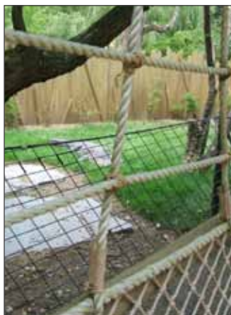
ProManila navy lashed with #84 Polyester twine

Lashing cord is usually matched in color to the border rope.