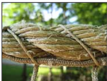
1.25" ProManila lashed to M1250 with #36 Polyester twine