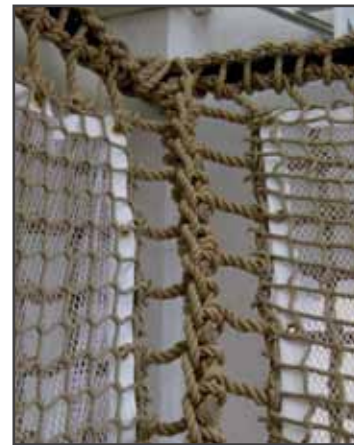
5/8" 3- strand Polyester rope, Netting; N815, DNR800