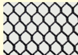
DNR900 FR 3/8" Knitted Polyeter

Debris liners are available in roll form with selvage edge or in tarp configurations with a web border and grommets.