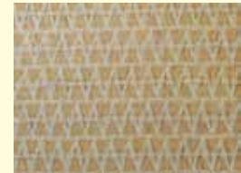
RPY13ANS* 1/16" Knitted Polyethylene Opacity 85 %