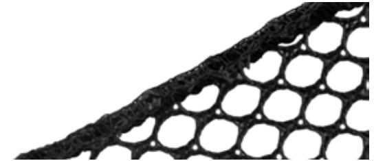
DNR-900 with 1/4 inch rope border