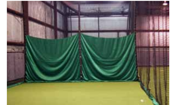
RPY13AN with N-367 Netting