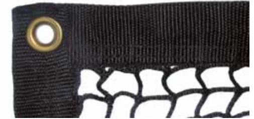
3 inch web border with grommet