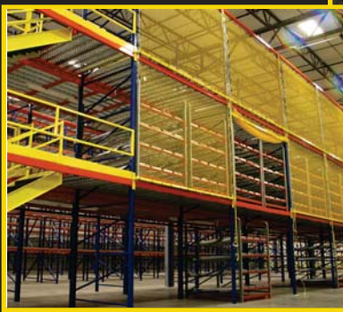
Elevated Rack Guard