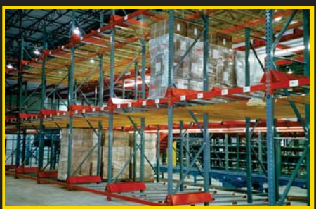
Horizontal Rack Guards