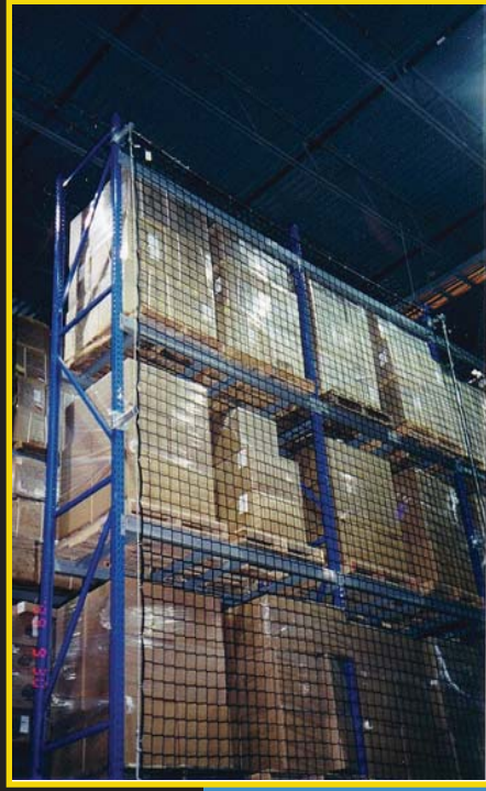
Offset Rack Guards