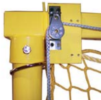
top left corner