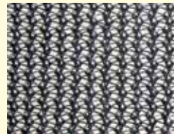
WS70BK* 1/8" Knitted Polyethylene Opacity 70 %