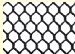
DNR FR 1/4" Knitted Polyester

Debris liners are available in roll form with selvage edge or in tarp configurations with a web border and grommets.