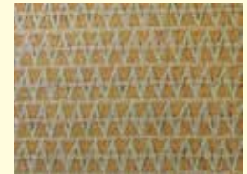
WS85SD 1/16" Knitted Polyethylene Opacity 85 %