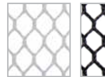
RPY14WH / RPY14BK

Call InCord for all your netting needs at 1-800-596-1066