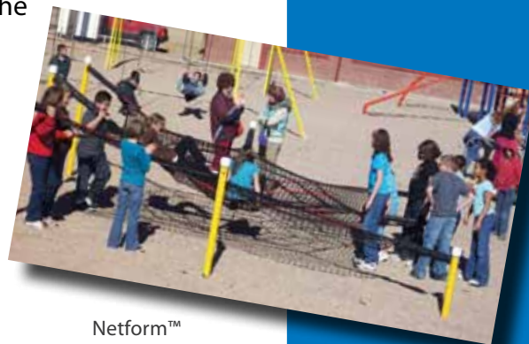
Netform™ Spider Web