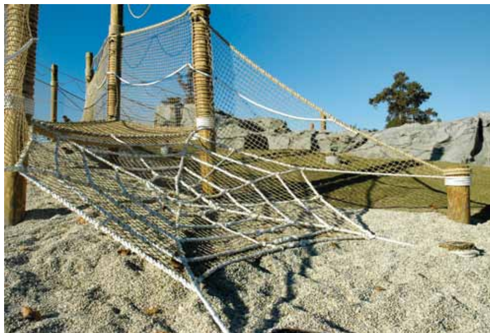
ProManila Ultra™ Spider Web

InCord's netting and rope products help to create nautical, rustic and natural themes for recreation and play.