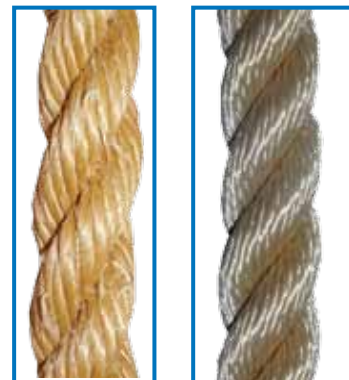
ProManila Ultra3™ and Polyester ropes are UV stabilized for long life.

Depending on attachment technique, common fence staples may be the only hardware you may require, and a boring bit if passing the rope through an upright.