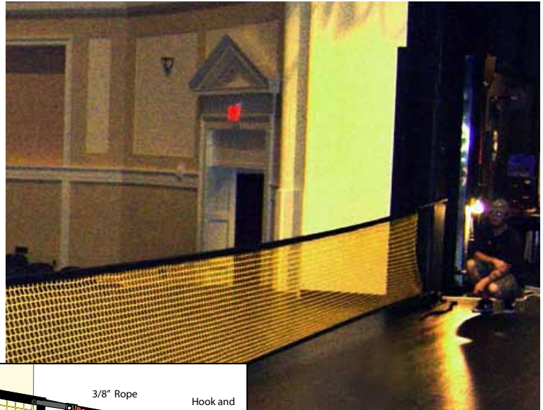
UNC Chapel Hill Installation

InCord personnel may be contracted to site inspect and measure your stage with full turnkey installation available. Contact InCord for additional information.