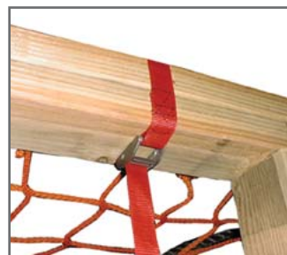
Tension Straps installed on all four corners of the safety net.

Step 3. Add additional tension straps every four feet around the perimeter of the net until all four sides of the net have been secured. Make sure that the strap buckles are positioned under the top plate to prevent a possible trip hazard. Note: Use only InCord provided tension straps.